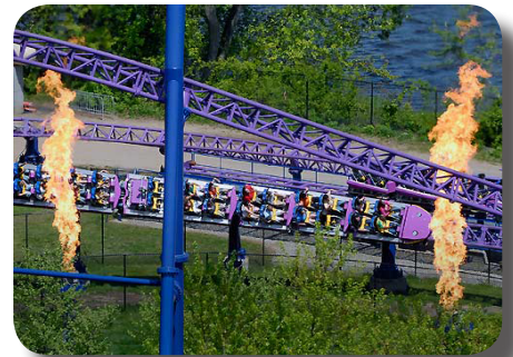
Photos of Bizarro

A video of the thrill ride can be viewed at http://www.techni-lux.com/default.aspx?tabid=106 .